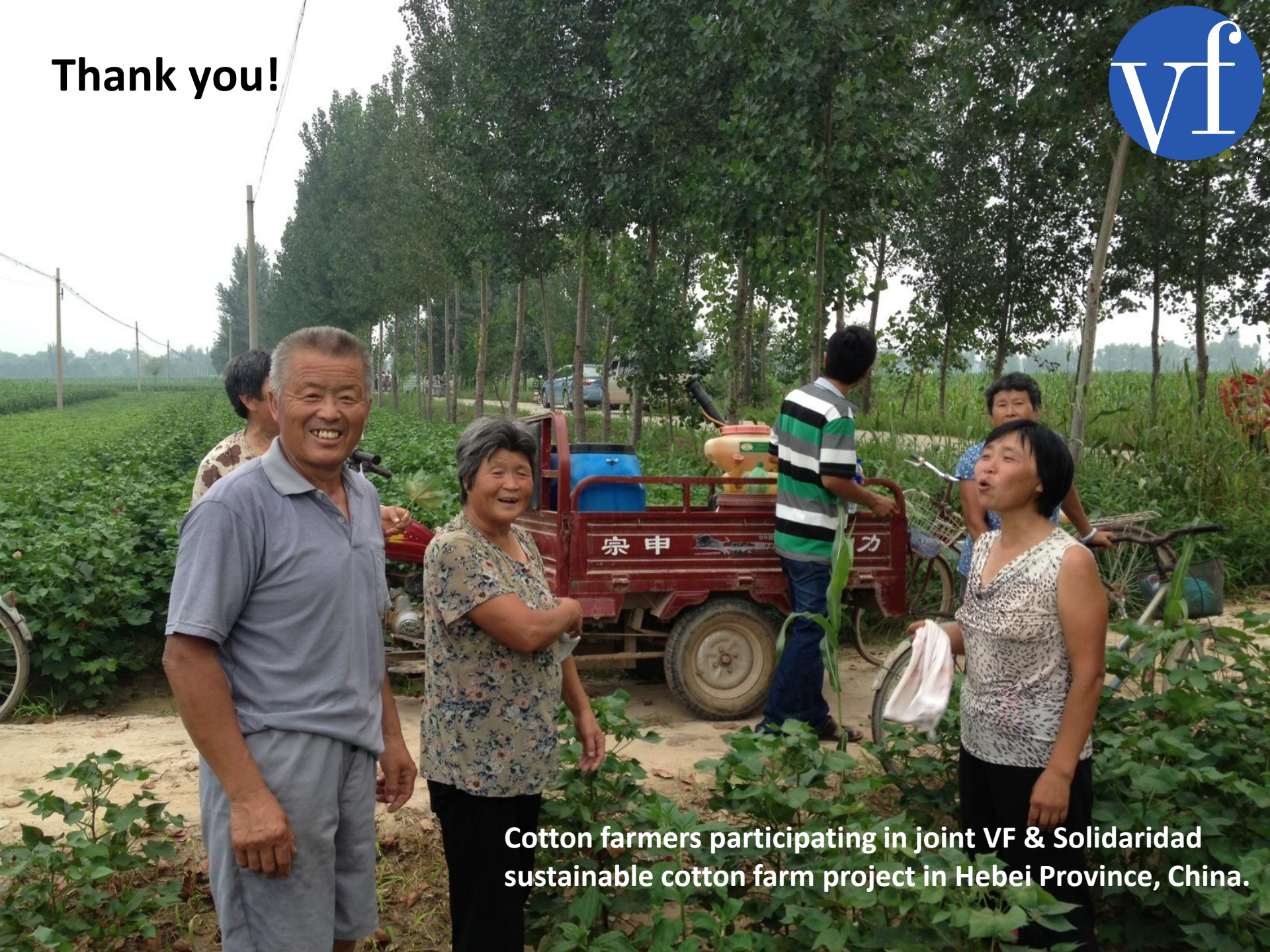
Cotton farmers participating in joint VF & Solidaridad sustainable cotton farm project in Hebei Province, China.